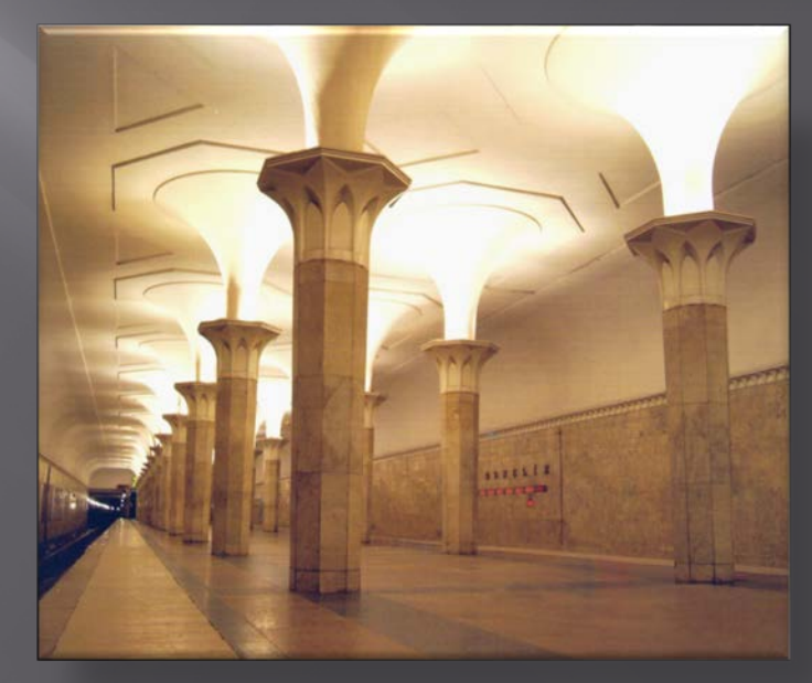
Design of columns of "Genjlik" station