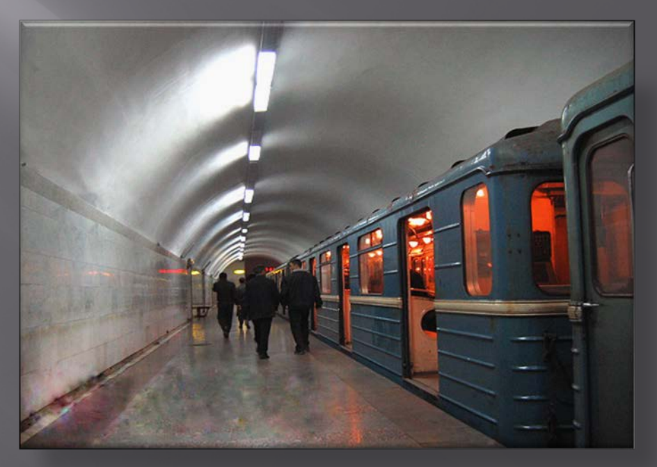
The platform of "Jafar Jabbarly" station