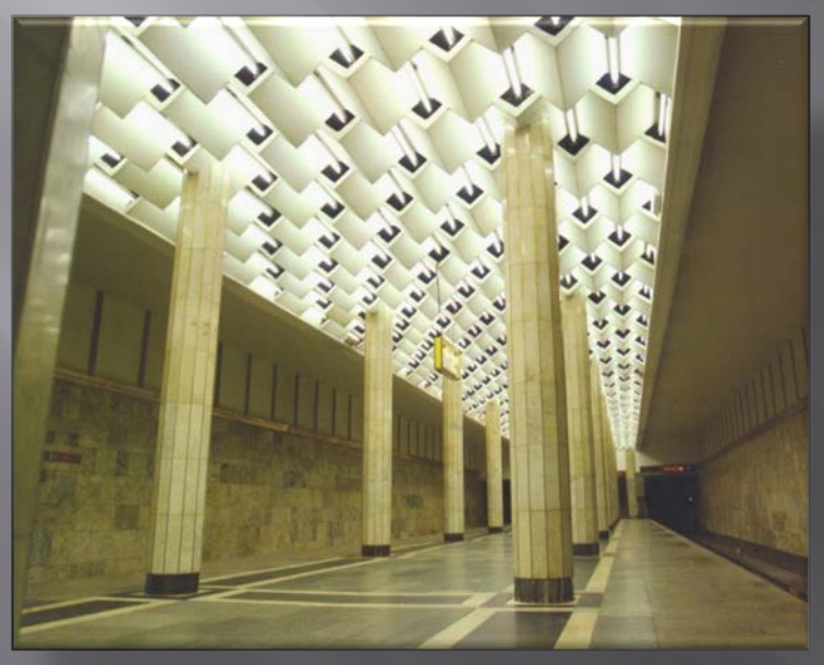
Hall and platform of "Ulduz" station