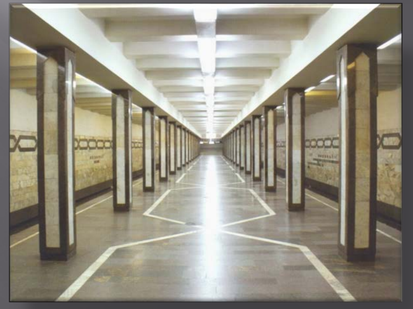
Central hall of "Ahmedly" station