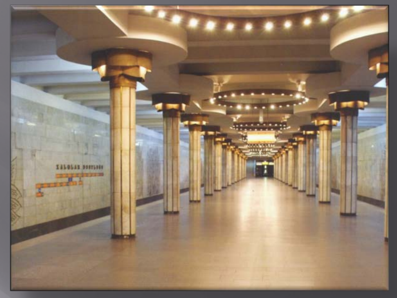
Central hall of "Khalglar dostlugu" station