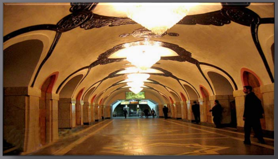
Central hall of "Elmler Akademiyasi" station