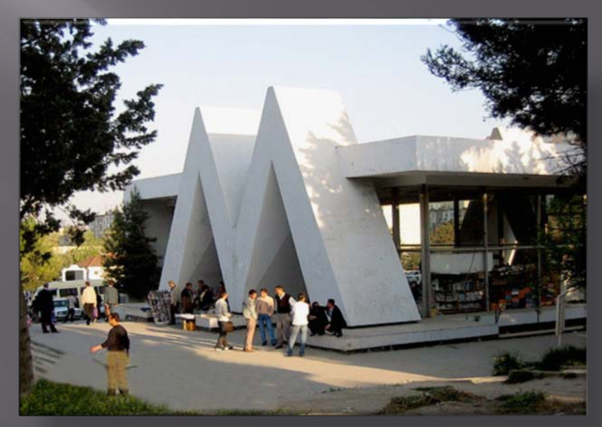
Overground lobbies of "Memar Adjemy" station