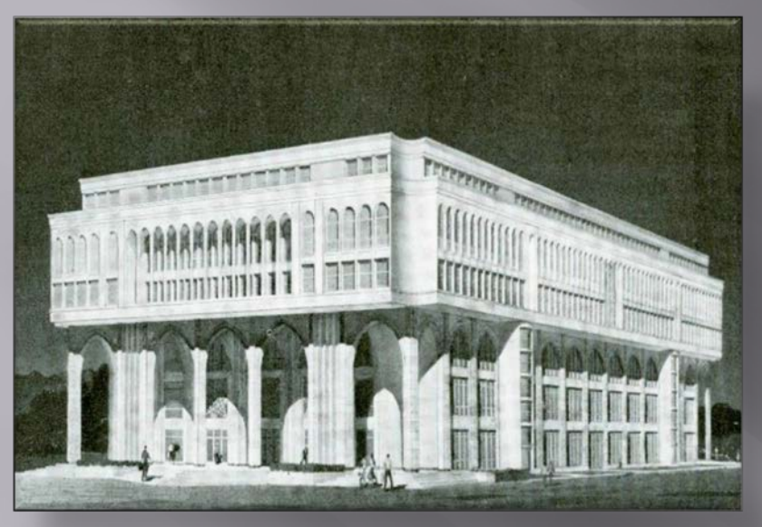
Overground lobbies of "Elmler Akademiyasi" station