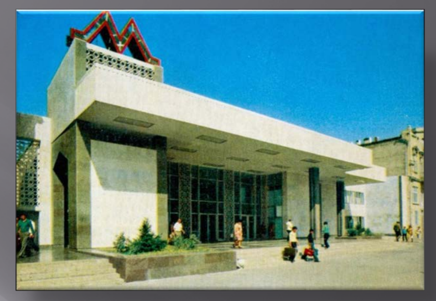
Overground lobbies of "Nizami" station