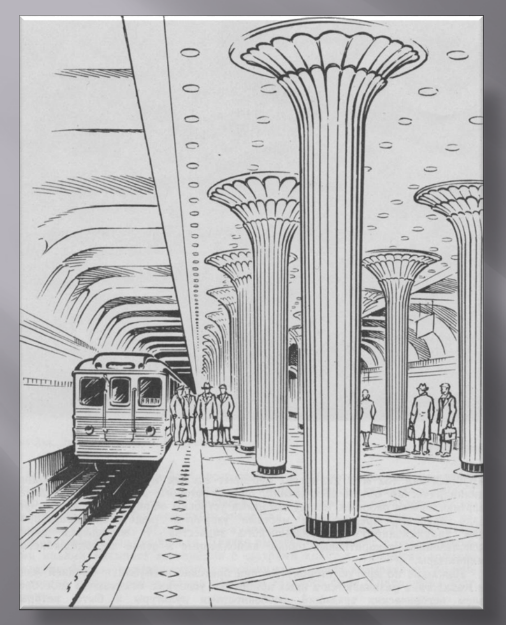
The platform of "Nariman Narimanov" station sketch of academician M.Useinov