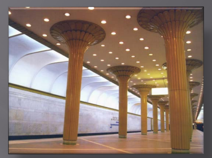
Design of columns of "Nizami" station